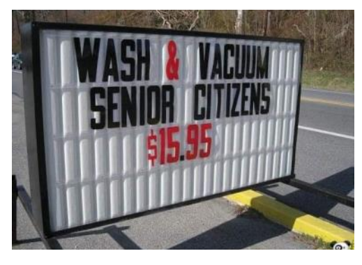
Sounds like a good deal to me. Sign me up.

Services: Sunday—9:00 a.m., 10:00 a.m., and 6:00 p.m. Wednesday—7:00 p.m.